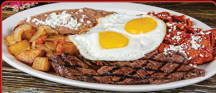
DEL PATRON $15.95 Asada, chilaquiles, eggs, potatoes & beans