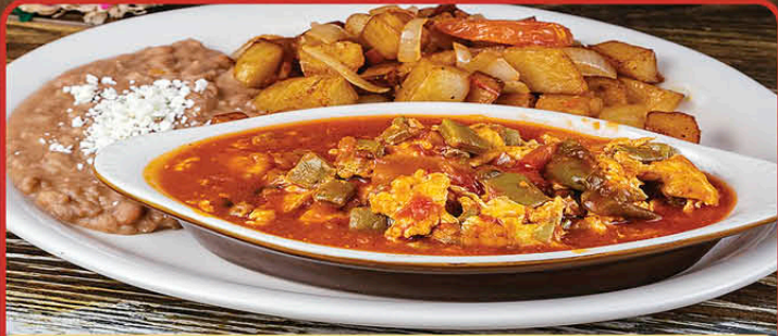
AHOGADOS CON NOPAL $11.95 Eggs, cactus & salsa, potatoes & beans