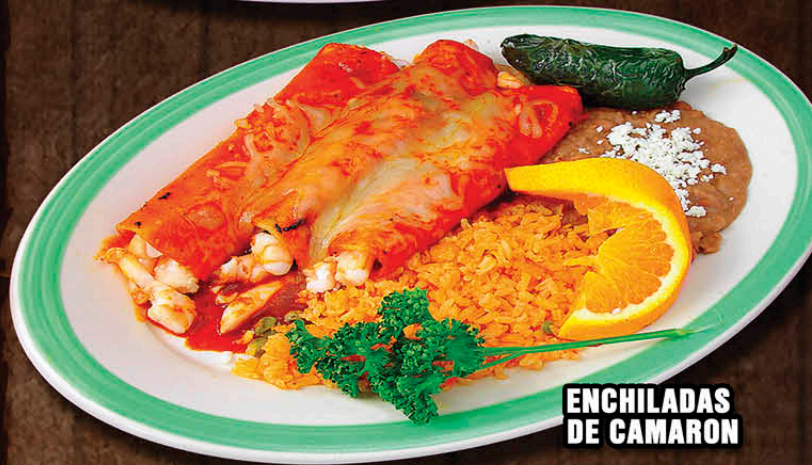
ENCHILADAS DE CAMARON