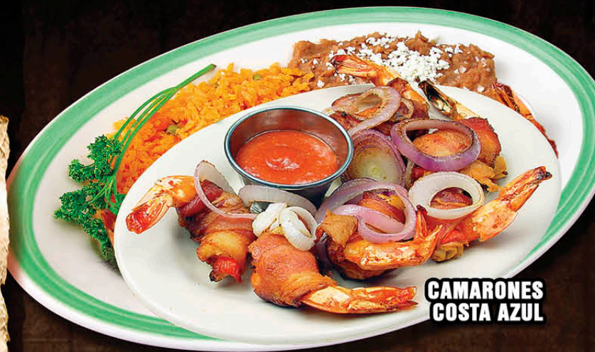
CAMARONES COSTA AZUL