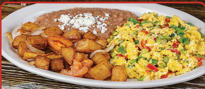
A LA MEXICANA $11.95 Eggs, bell peppers, onion, potatoes & beans