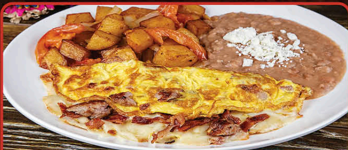
VAQUERO OMELETE $12.95 Sausage, bacon, ham, potatoes & beans