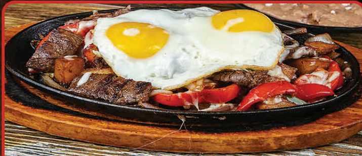
DEL HERRERO $15.95 Asada fajitas, potatoes, eggs, cheese & beans