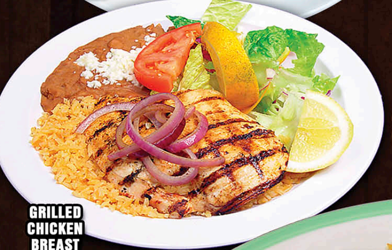
GRILLED CHICKEN BREAST