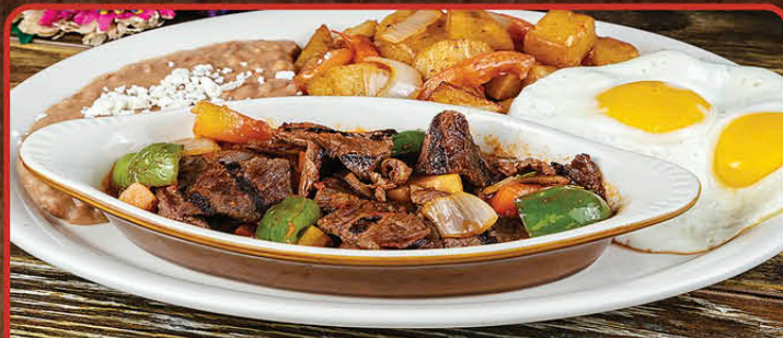
MI RANCHITO $15.95 Steak picado, eggs, potatoes & beans