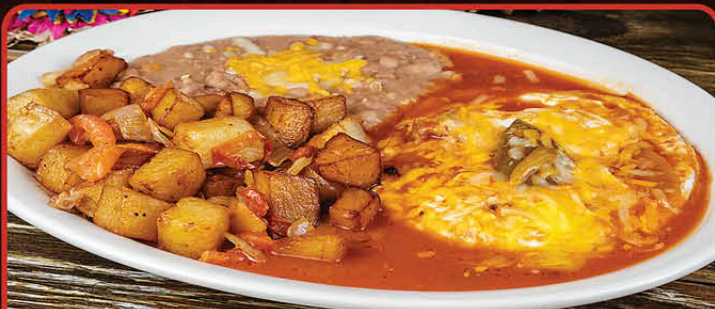
RANCHEROS $11.95 Eggs, salsa ranchera, potatoes, cheese & beans