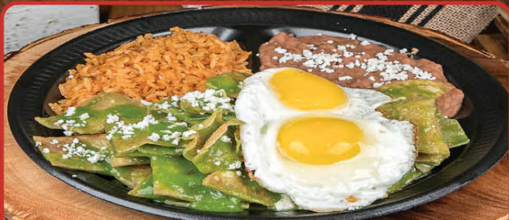
CHILAQUILES $11.95 Red or green chilaquiles, potatoes & beans