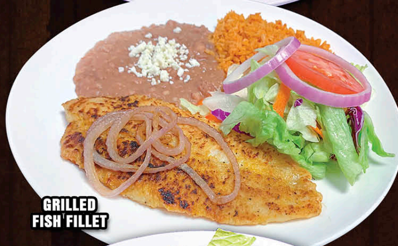
GRILLED FISH FILLET