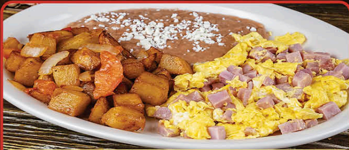
HAM & EGGS $11.95 Ham & eggs, potatoes & beans