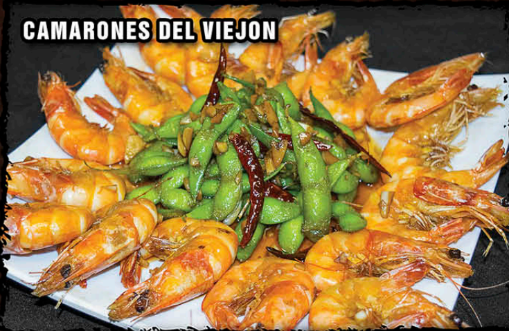
CAMARONES DEL VIEJON