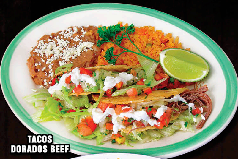
TACOS DORADOS BEEF