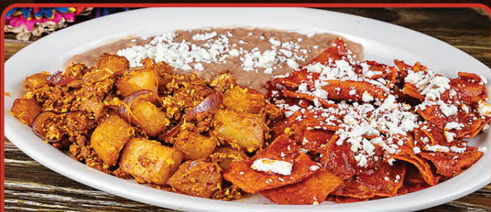
CHORIPAPA $12.95 Eggs, potato, chorizo, potatoes & beans