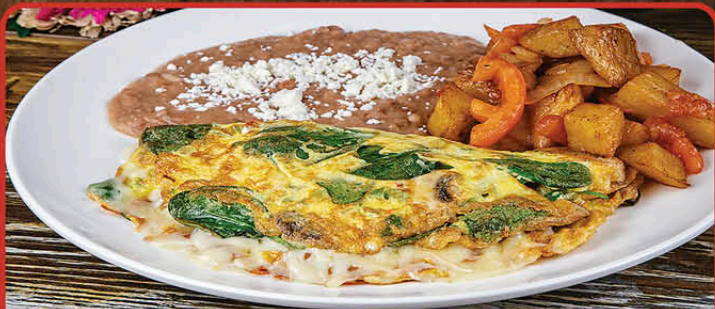
BRONCO OMELETTE $12.95 Spinach, mushrooms, bell pepper, onion & cheese