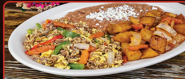
MACHACA $14.95 Shredded beef, eggs, potatoes & beans