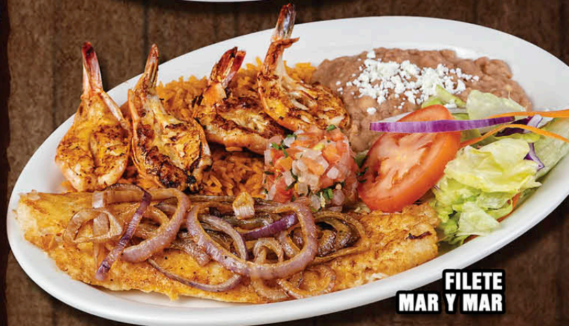
FILETE MAR Y MAR