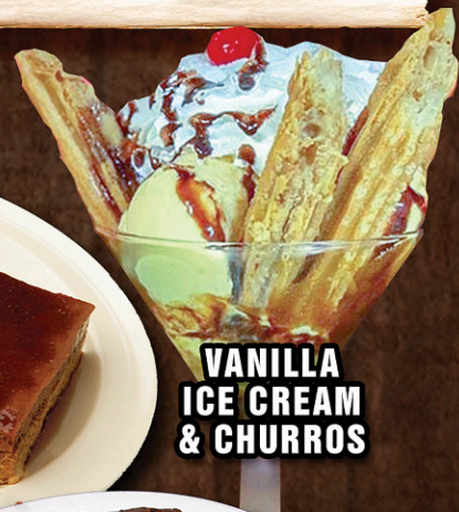
VANILLA ICE CREAM & CHURROS