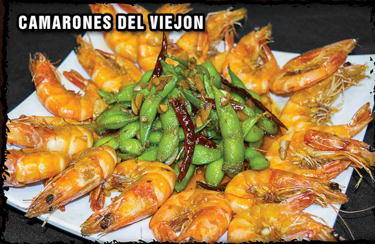
CAMARONES DEL VIEJON