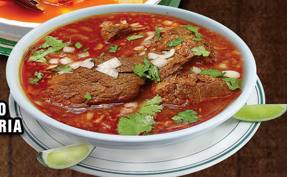
CALDO DE BIRRIA