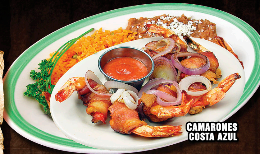
CAMARONES COSTA AZUL

Stuffed with shrimps, octopus, clams & abalone.