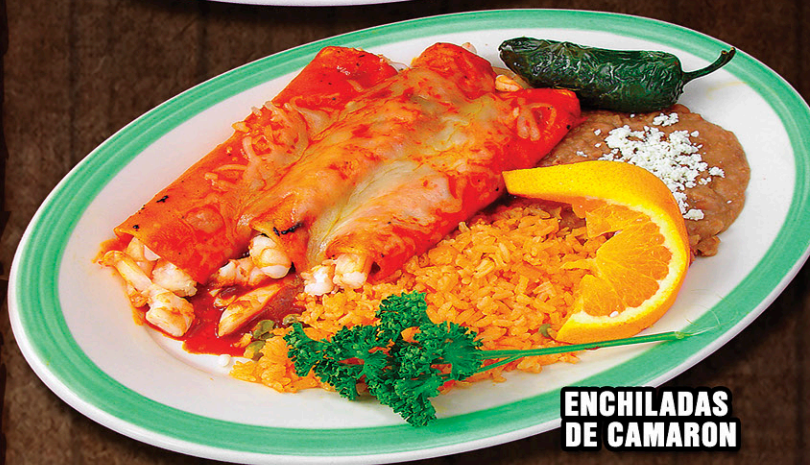
ENCHILADAS DE CAMARON