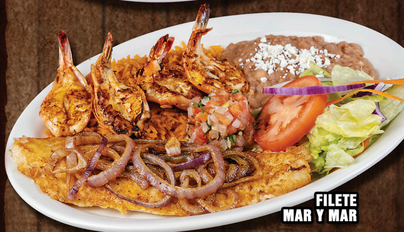
FILETE MAR Y MAR